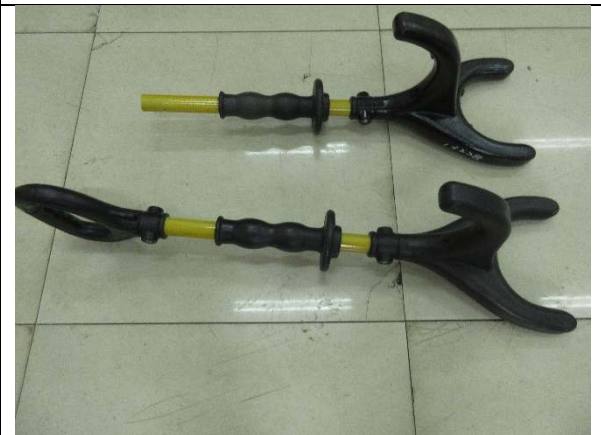
Photo4: The samples after the test