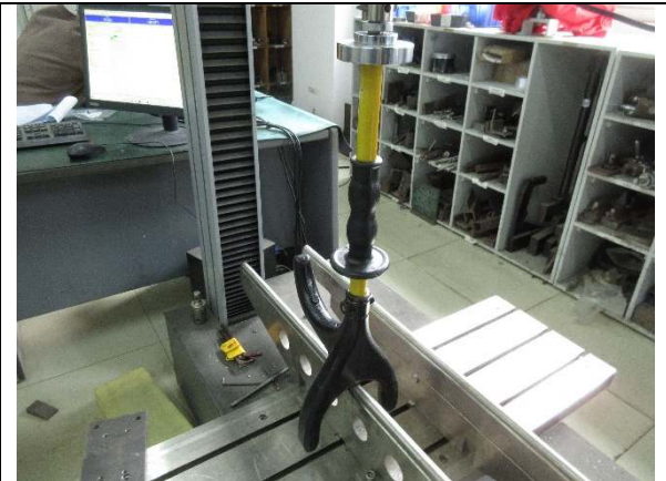
Photo2: During test (Push test)