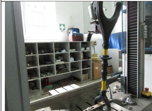
Photo3: During test (Pull test)