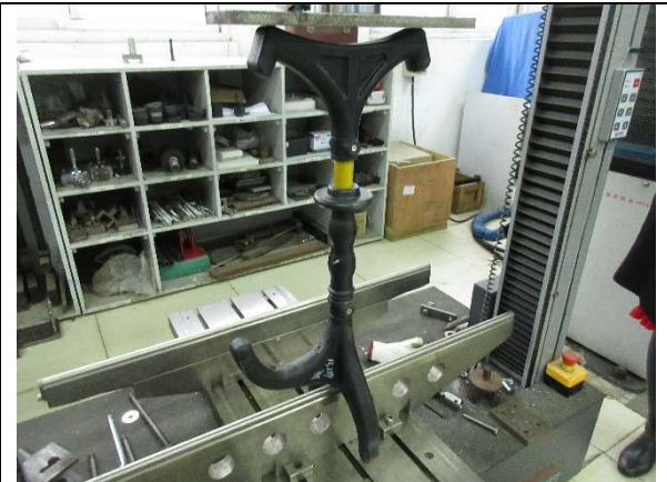
Photo2: During test (Push test)