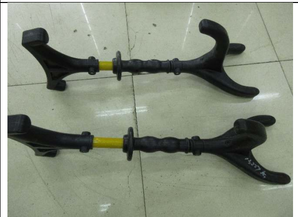
Photo4: The samples after the test