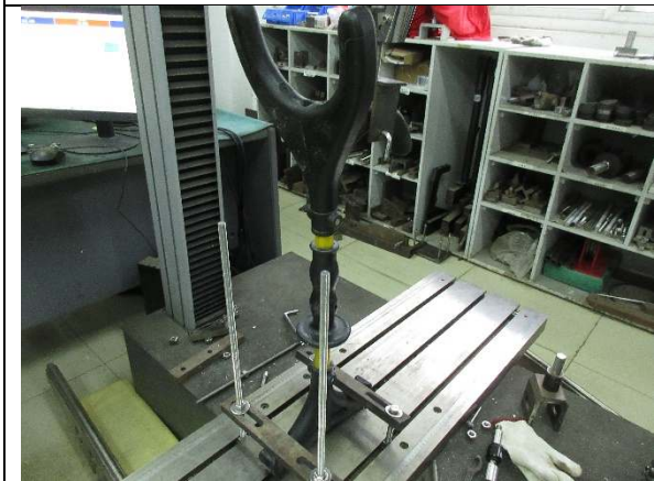
Photo3: During test (Pull test)