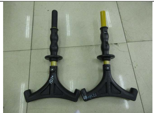
Photo4: The samples after the test