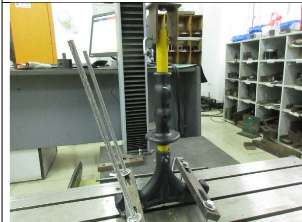
Photo3: During test (Pull test)