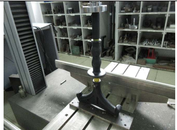
Photo2: During test (Push test)