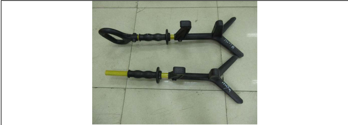
Photo5: The samples after the test