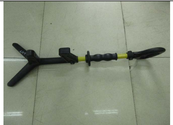
Photo2: Sample (Pull test)