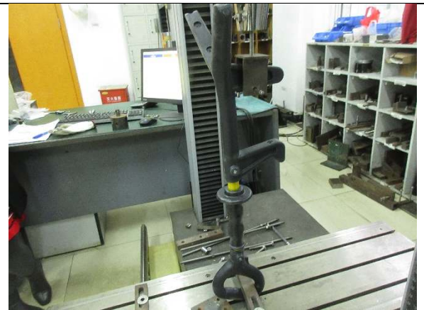
Photo4: During test (Pull test)