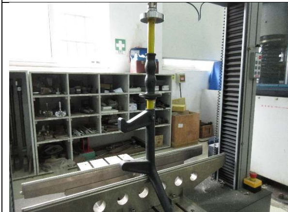
Photo3: During test (Push test)