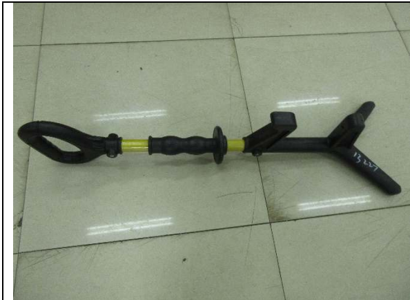
Photo1: Sample (Push test)